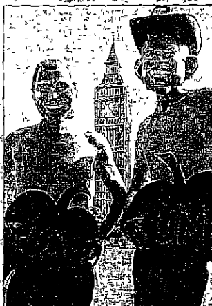
FACTS BARE: A protest yesterday

TONY Blair's dossier of "death" does not appear to justify attacking Iraq, said military experts.