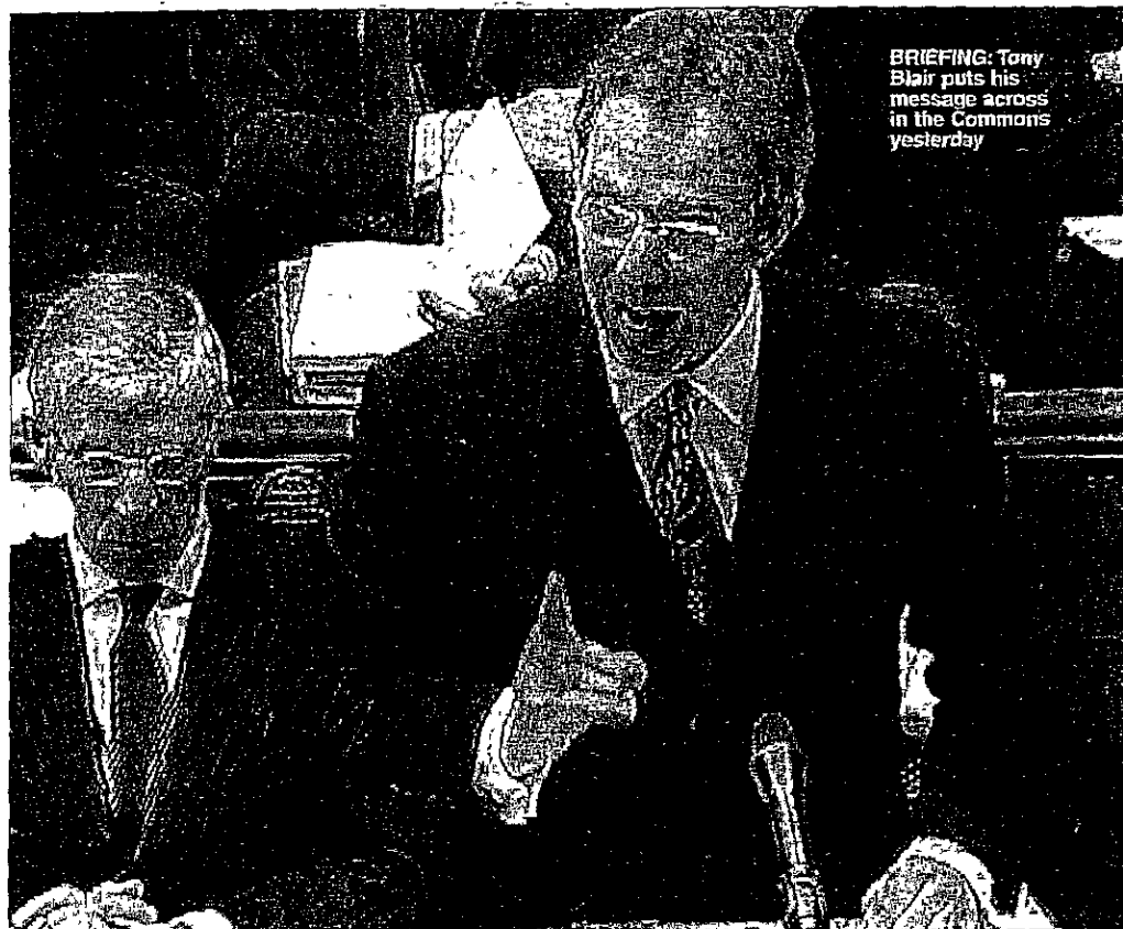
BRIEFING: Tony Blair puts his message across in the Commons yesterday