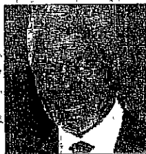
The Observer report last week (above), which led to the arrest of an employee at GCHQ (far right), the government spy-listening centre in Cheltenham. Left, Kofi Annan, whose office is investigating the bugging, which was ordered by the US National Security Agency, where (right) President Bush is pictured with the NSA director, Lieutenant-General Michael Hayden.